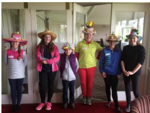
Some extra photos from the Easter Bunnies Day!